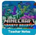
Minecraft - Teacher Notes