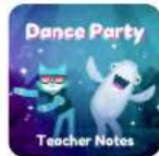
Dance Party - Teacher Notes