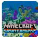
Minecraft Voyage Aquatic